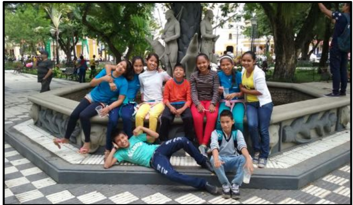
An end-of-year day out at Trinidad's central plaza for the Monday group.