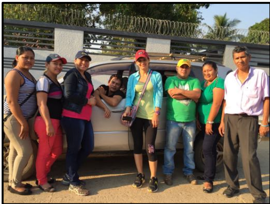
FT Health workers in San Borja.