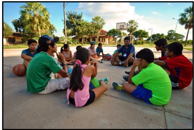
A Bible study on the basketball court.