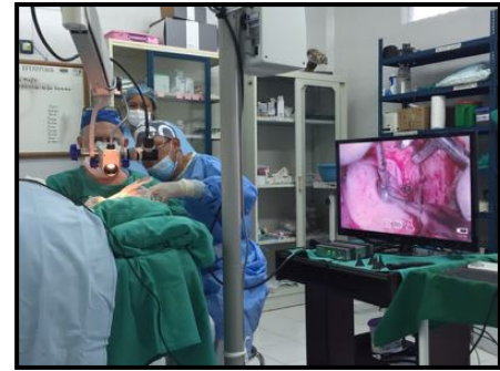
2015's Ear & Hearing surgical campaign in full swing.