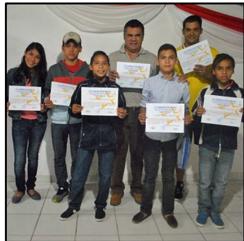
FT English class students with certificates.