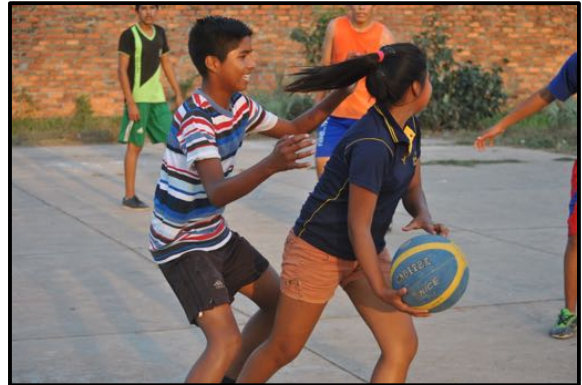
An FT Basketball training session in progress.