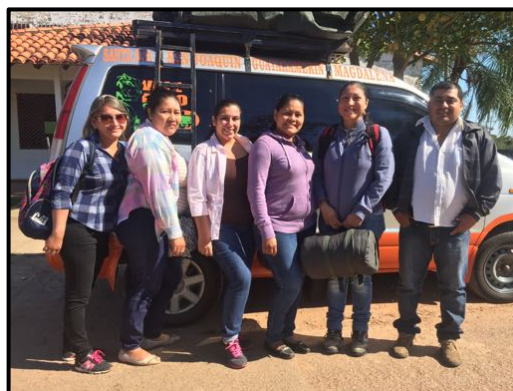
An FT Health team sets off for another round of checks in a remote village.