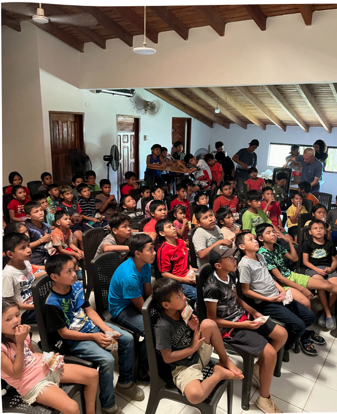
Celebrating "Children's Day" with popcorn and a movie